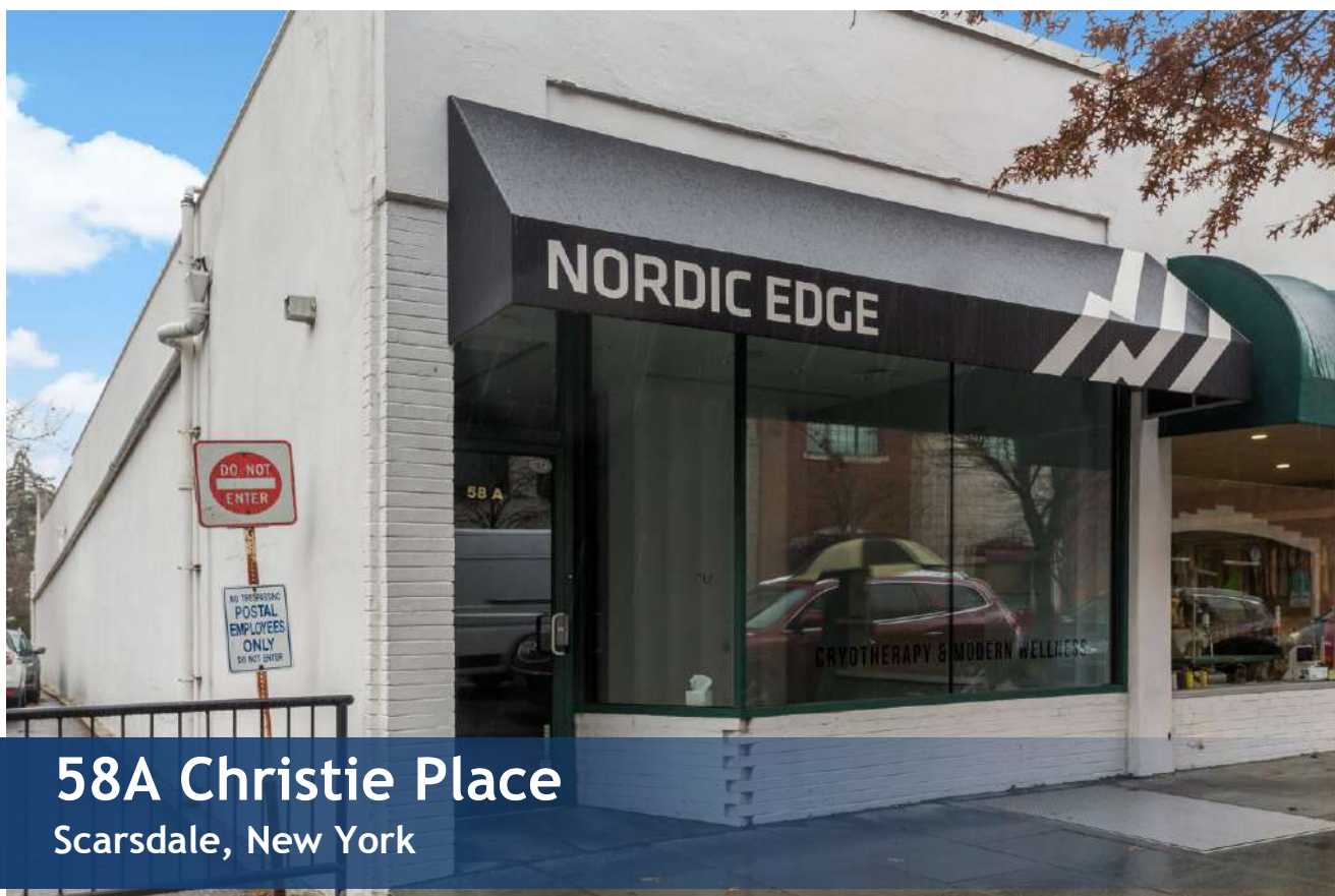
58A Christie Place Scarsdale, New York