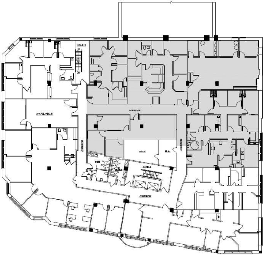
① EXISTING CONDITION PLAN - 2ND FLOOR SCALE: 1/8" = 1'-0"