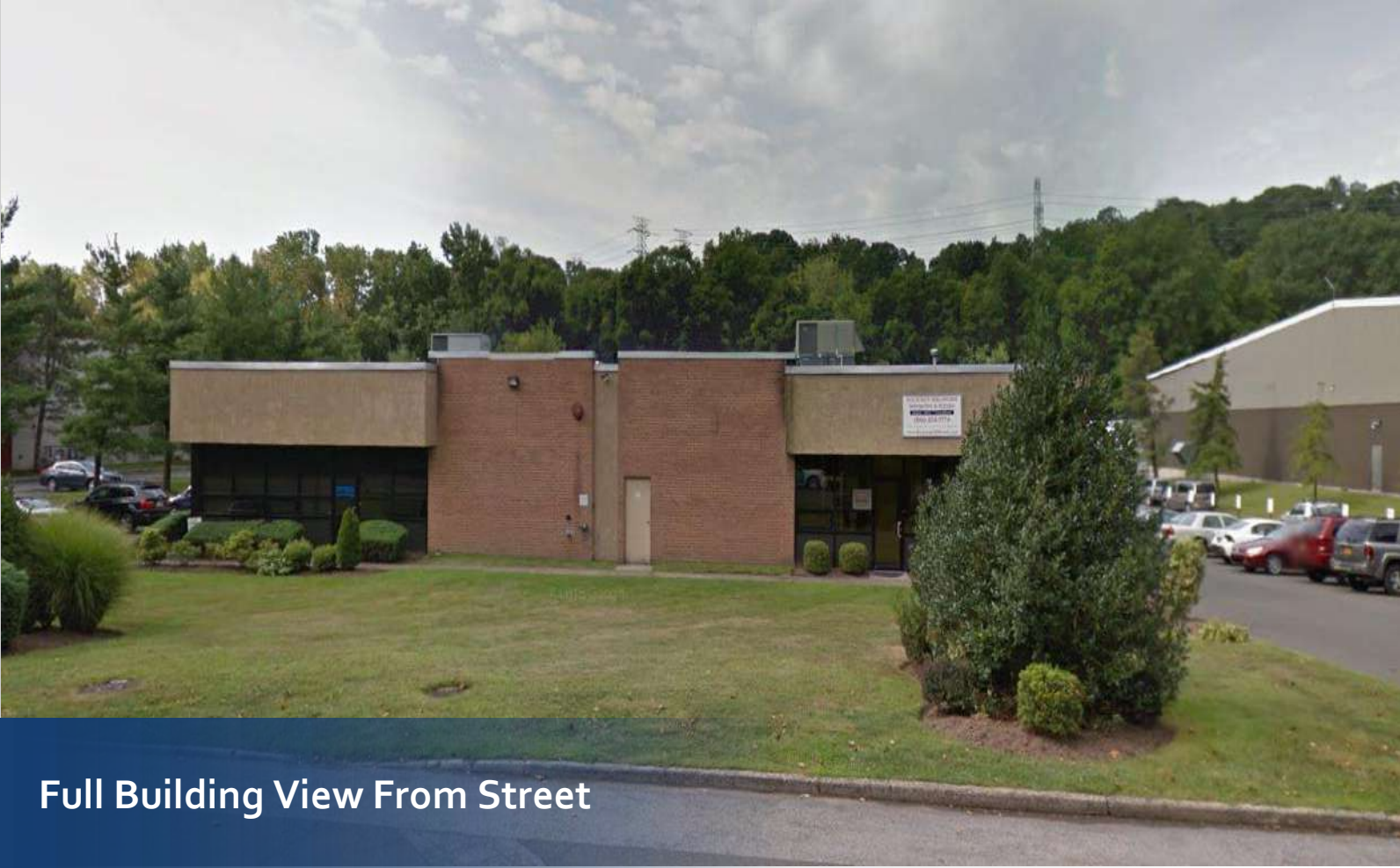
Full Building View From Street